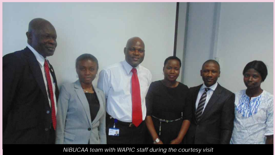
NIBUCAA team with WAPIC staff during the courtesy visit

Finally, the management team of Wapic was challenged to take advantage of the technical expertise of the coalition with a view to improving the well being of their employees. There is wisdom in investing in your employees because it will eventually strengthen the bottom line.