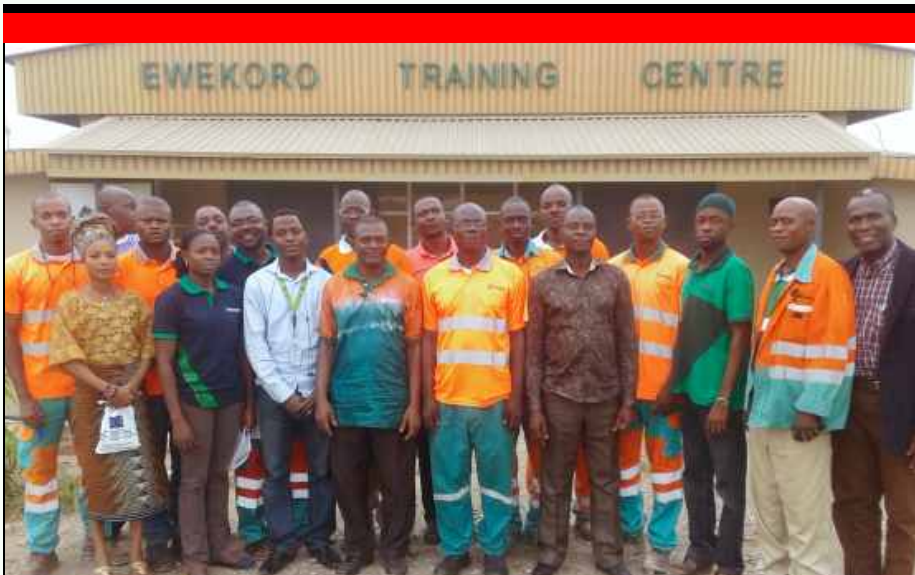
Trained Peer Educators in Ewekoro Plant

A s a result of two training sessions in January, Lafarge Cement WAPCO Nigeria PLC, has 33 new ATM Peer Educators (PEs) in its Ewekoro and Sagamu plants.