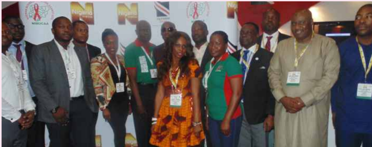
Group photo 2Face ,Talavera Groups and NiBUCAA